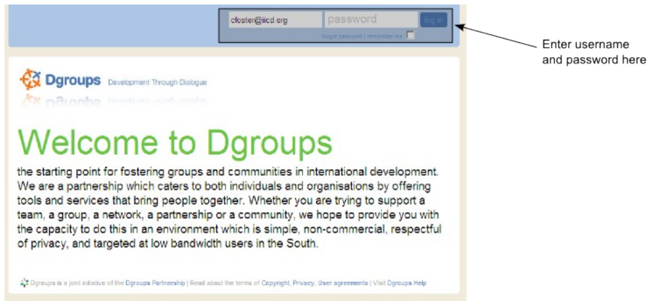
Figure 1: Dgroups login page

To login to dgroups go to http://d2.dgroups.org and enter your username (your email address) and your password in the box as shown below