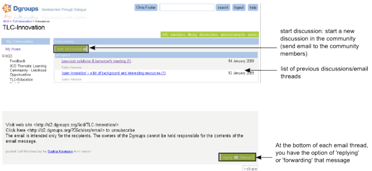
Figure 5: (a) The 'discussion' page for a community, allows you to add a new discussion and see previous ones

(b) For each discussion/email thread you can reply using the website